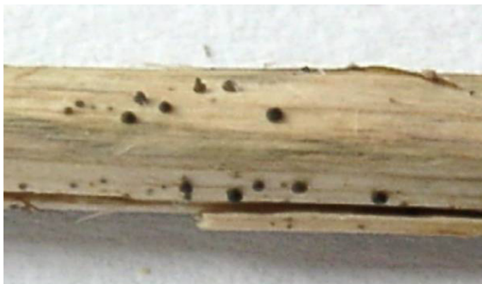
Figure 4. Perithecia of Leptosphaeria rubicunda .