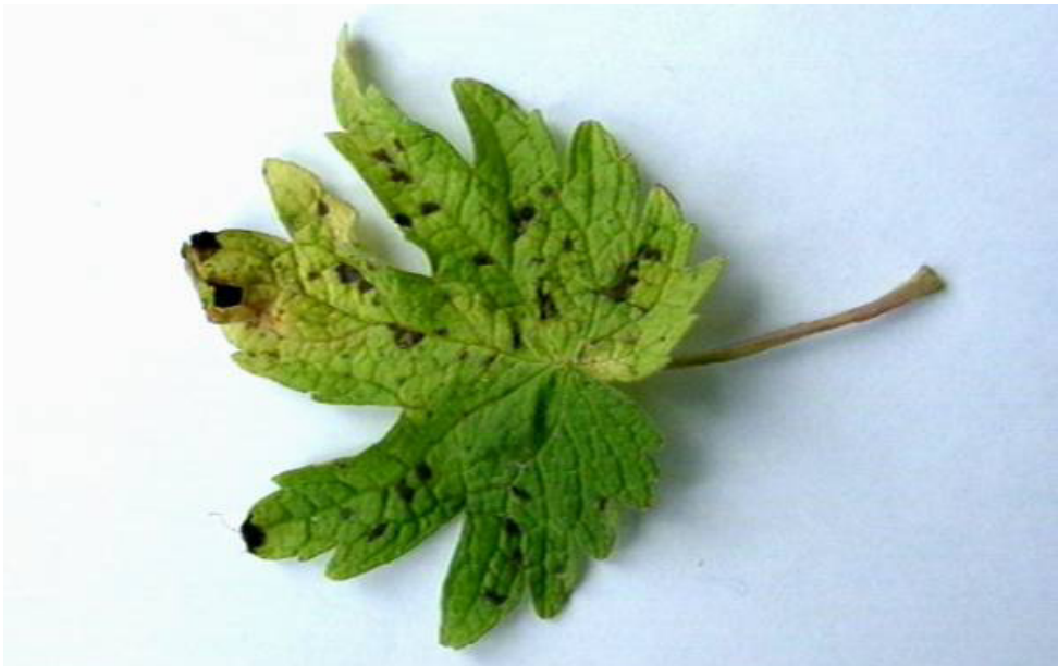
Figure 2. Regular necrotic spots from which Phoma nepeticola was isolated.