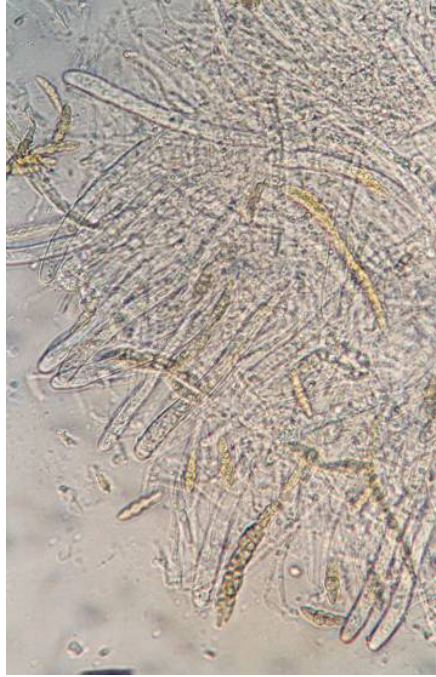
Figure 5. Asci and ascospores of Leptosphaeria rubicunda (640 x).