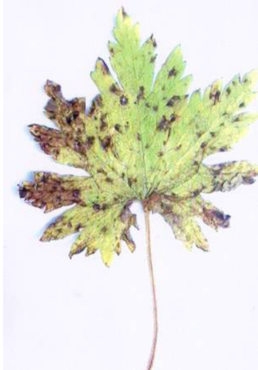
Figure 1. Necrotic irregular spots of the leaves from which Alternaria alternata was isolated.