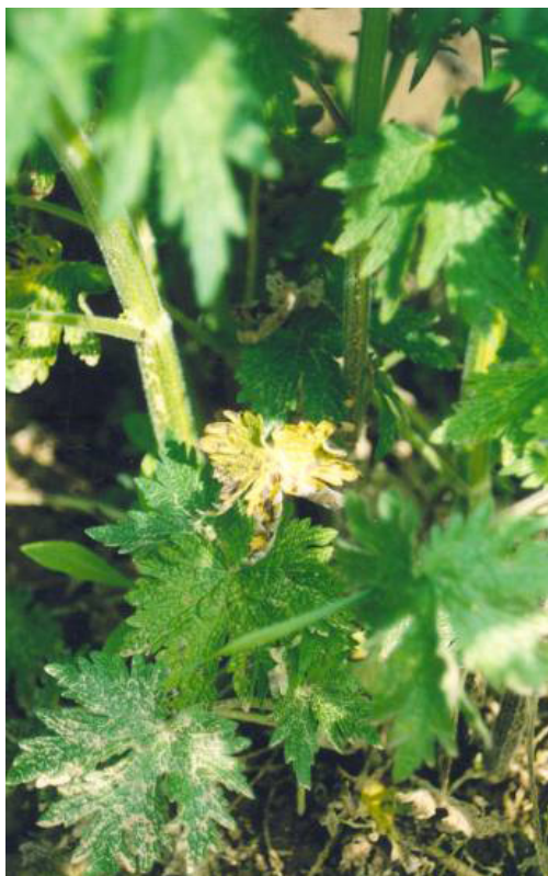
Figure 3. Yellowing of the diseased leaves.