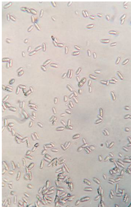
Figure 6. Conidia of Phoma nepeticola (640 x).